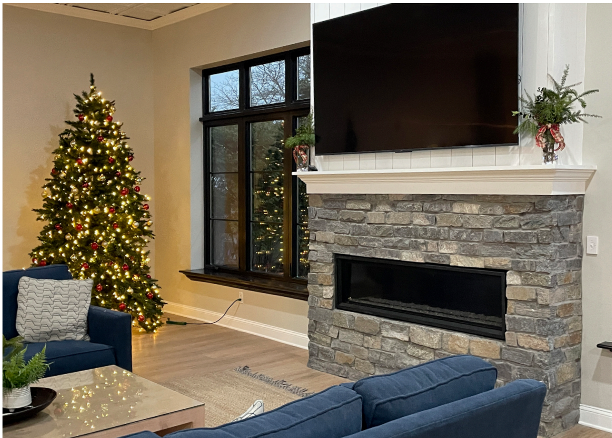
Our beautifully renovated community room awaits your company!