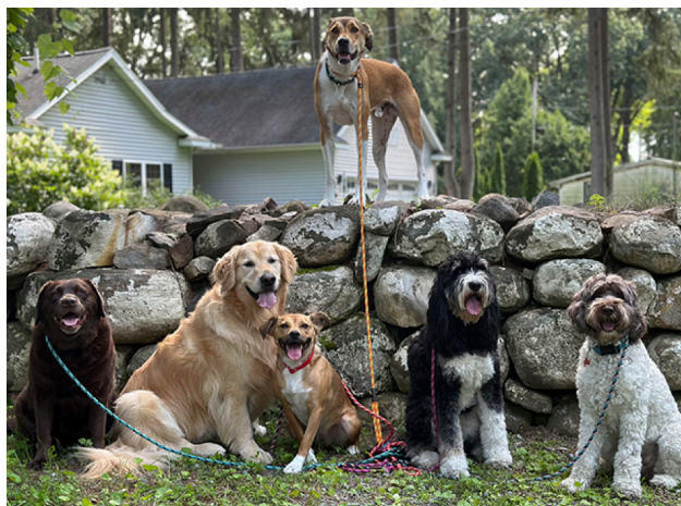
Group photo of one of the dog packs