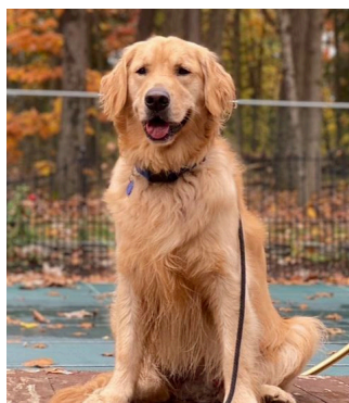
Murphy by the pool

When the van arrives at my house, I jump in and go right to the open area in the back, where I either sit, lie down, or cuddle with some of my friends. Some of the dogs prefer travelling in a crate, to give them their own private space, and that's okay too. Then, when we are unloaded from the van, we each get an individual potty break before starting the walk. During the walk, we stop several times, since not all of the dogs need a potty break at the same time. (We avoid peoples' front yards, and use side streets and wooded areas. Karissa is always careful to pick up after us.)