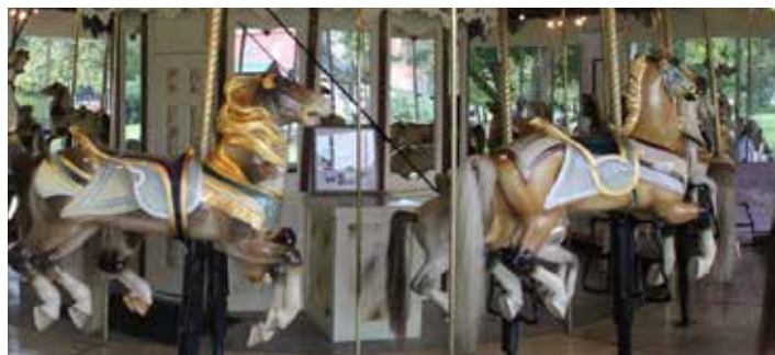
The Illions Carousel Today, in Congress Park

Today, the former Kaydeross Park carousel continues to play its traditional calliope and organ tunes in Congress Park, and it is now one of only six remaining Illions in existence (and, as previously mentioned, the only known two-across model), with a new computer-controlled system having replaced the original belt-driven