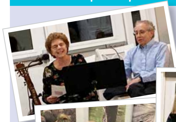
An Evening of Song with the Cliff Dwellers