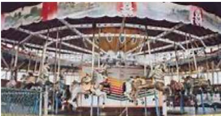
The Illions Carousel in Kaydeross Amusement Park (pre-1987)

According to the National Carousel Association, of the almost 4,000 wooden carousels carved in America between 1885 and 1930, fewer than 175 vintage carousels still operate today. The Congress Park carousel is the only known two-row (across) carousel carved by Marcus Charles Illions that is still intact today. Illions was a master wood carver who came to the U.S. from Russia in 1888, and he was considered, according to the NY Times, to be “the Michelangelo of carousel carvers.” The carousel has 28 horses – each one unique - sporting beautiful hand-carved heads that Illions himself carved, well-decorated bodies, and real horse-hair tails.