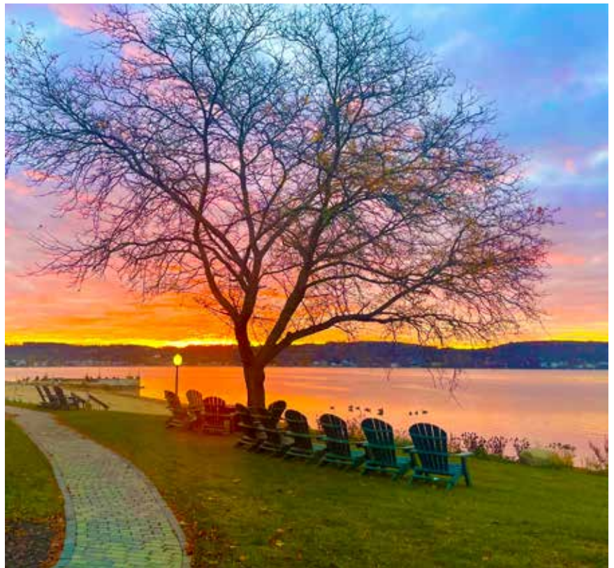
Sunrise at Water's Edge

While winter grips the region and--at least in my view--holds on for far too long, we have much to look forward to. I am extremely excited for the many changes ahead and to seeing the return of many of you who winter in warmer places, when we will have a new gym and expanded community room to enjoy. Happy New Year to you all!